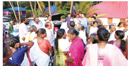
VOLUNTEERS OF VIVEKANANDA STUDY CIRCLE (VSC) DISTRIBUTING RICE BAGS TO RESIDENTS OF POONTHURA WHO WERE AFFECTED BY CYCLONE OCKHI. THE GROUP DISTRIBUTED 1,020 KG OF RICE TO 248 HOUSEHOLDS IN THE COASTAL HAMLET